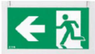
Wall surface mounting